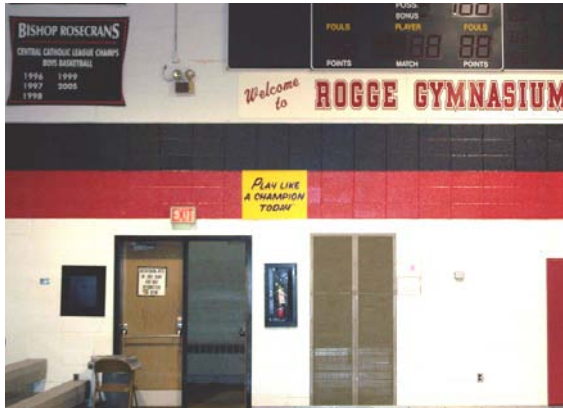
The Signature PLC Sign in the Bishop Rosecrans Gym under which PLC Athletes and Parents are Acknowledged